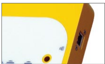
Hi-speed Ethernet communication