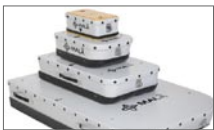
Fits 100-800MHz shielded antennas