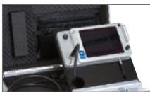
Adjustable viewing angle