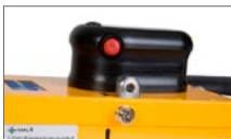
In-built antenna controls