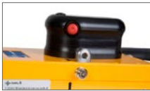
In-built antenna controls